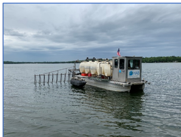
Figure 1. Applying P-binding compounds to a lake.