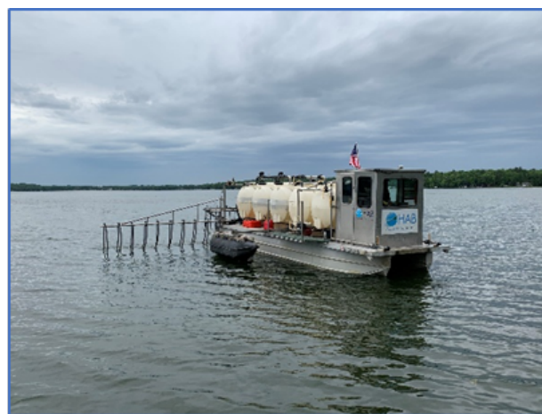
Figure 1. Applying P-binding compounds to a lake.